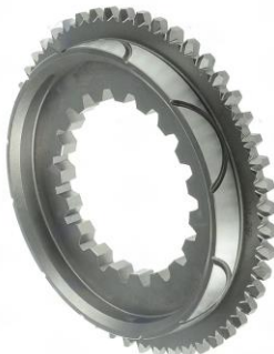
SYNCHRONIZER CONE 19T/51-T PART NO: 1250 304 292