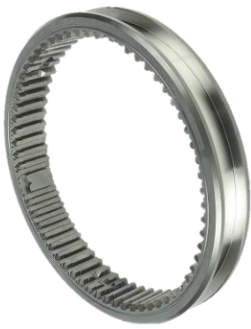
SLIDING SLEEVE 63T PART NO: 1257 304 020