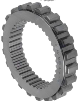
SYNCHRONIZER HUB 22T PART NO. 1295 304 235