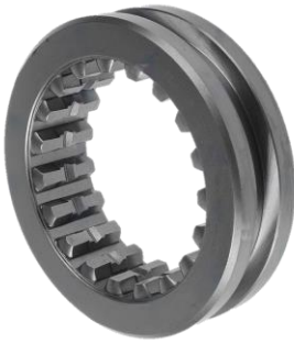
SLIDING SLEEVE 19T (BLOCK DIA DIFF) Part No : 1250 304 141