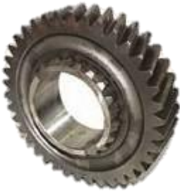
GEAR 2ND SPEED 38T O.E. Ref No. 1297 304 112