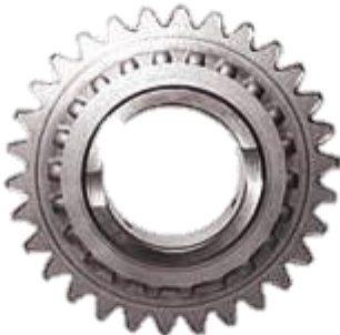
GEAR 4TH SPEED 30T/22T PART No: 1268 304 010