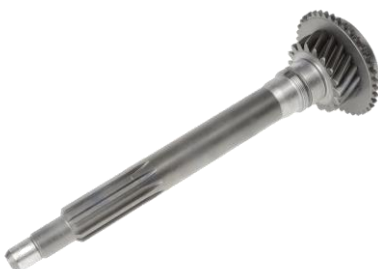
MAIN DRIVE SHAFT PART NO: 1249 202 526 WEIGHT: 2.58 KG