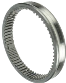
SLIDING SLEEVE 57T (1ST & 2ND SPEED) PART NO: 1257 304 020