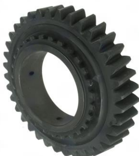
GEAR 2ND SPEED 36T PART No: 1250 304 029