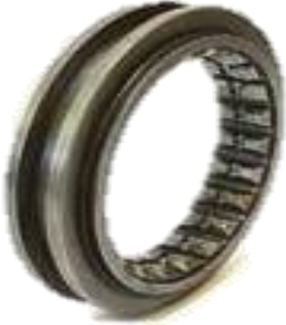
SLIDING SLEEVE 22T (1ST AND 2ND) PART NO.: 1297 304 119