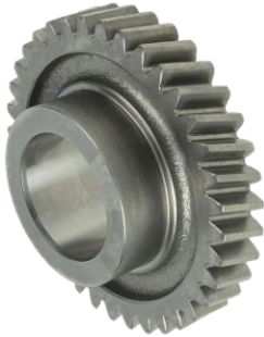
GEAR CONSTANT 36T PART No: 1250 303 074