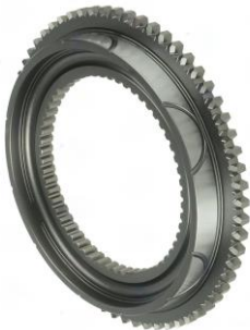
SYNCHRONIZER CONE 58T/63T PART NO: 1297 304 196