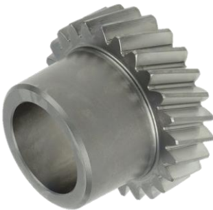
GEAR 3RD SPEED 25T PART NO: 1297 303 077