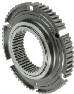
SYNCHRONIZER HUB 63T PART NO: 1268 304 007/ 1268 304 150