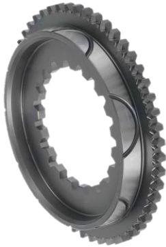
SYNCHRONIZER CONE 19/51T PART NO : 1272 304 136