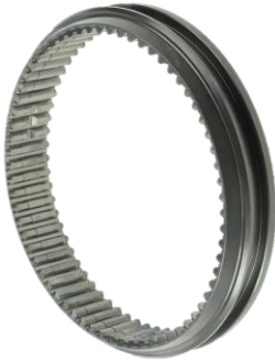
SYNCHRONIZER RING (BIG) PART NO : 1308 304 091