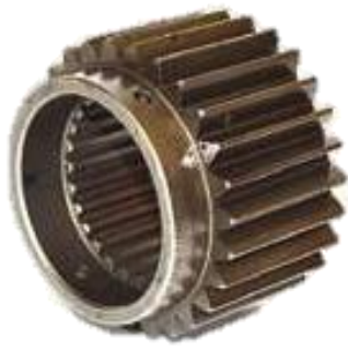
SUN GEAR 27T PART NO.: 1297 304 187