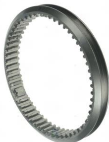
SLIDING SLEEVE 57T (FORK DIA GRIND) PART NO: 1310 304 202