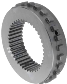
SYNCHRONIZER HUB 27T PART NO: 1250 304 235