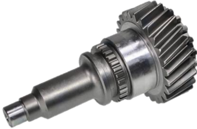
INPUT SHAFT 19T/25T PART NO: 1268 312 005