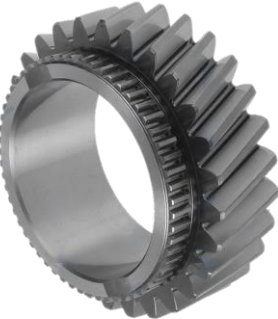
CONSTANT GEAR 28T PART NO: 1297 302 176