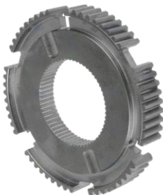
SYNCHRONIZER HUB (BIG) PART NO : 1307 304 608