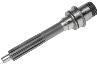
INTERMEDIATE SHAFT 30T PART NO: 1285 312 011/ 1285 212 005