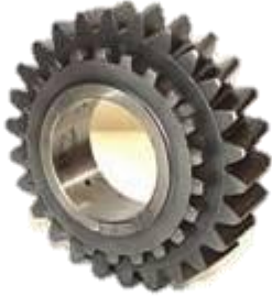
GEAR 4TH SPEED 26T PART No: 1250 304 217