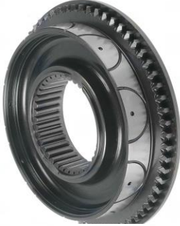
SYNCHRONIZER CONE 38T/63T PART NO: 1313 233 001