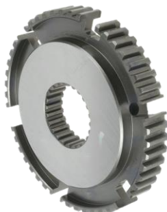
SYNCHRONIZER HUB 4TH & 5TH SPEED PART NO: 1292 304 041