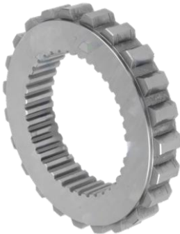
SYNCHRONIZER HUB 23T PART NO : 1297 304 188