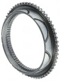
SYNCHRONIZER CONE (SMALL) PART NO : 1308 304 078