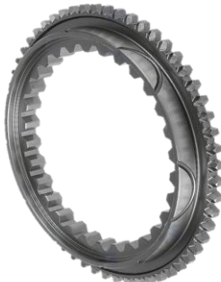
SYNCHRONIZER CONE 30T/57T PART NO.: 1312 304 027