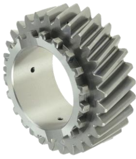
GEAR 5TH SPEED 29T PART NO: 1268 304 015