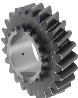
GEAR 5TH SPEED 24T/19T PART NO: 1268 304 005