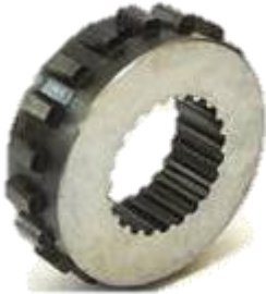
SLIDING HUB 19T PART No: 1250 304 185