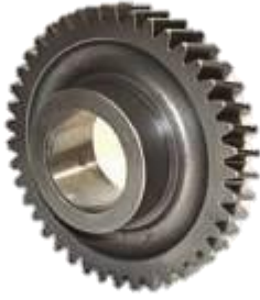
GEAR CONSTANT 41-T PART No: 1250 304 234