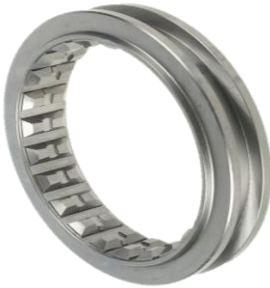
SLIDING SLEEVE 23T (3RD & 4TH) PART NO : 1297 304 120