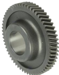
GEAR CONSTANT 59T PART NO: 1268 303 012