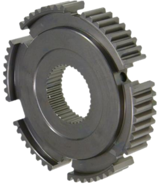
SYNCHRONIZER HUB (SMALL) PART NO : 1307 304 607