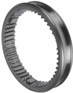
SLIDING SLEEVE 51T PART NO: 1285 333 020