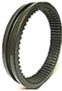
SLIDING SLEEVE (SMALL) PART NO : 1308 304 090