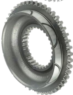
SYNCHRONIZER CONE 30T/48T PART NO: 1250 312 364