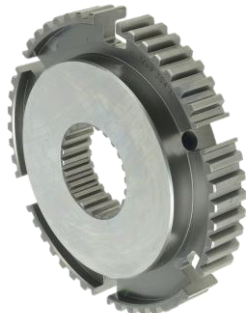
SYNCHRONIZER HUB 4TH & 5TH SPEED PAR NO: 1269 304 128