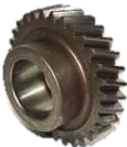
CONSTANT GEAR 32T PART NO: 1297 303 098