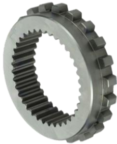
SYNCHRONIZER HUB 22T PART No: 1250 304 234