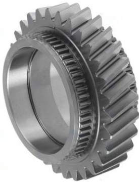
GEAR 4TH SPEED 30T PART NO: 1295 304 135