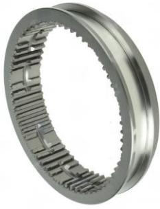
SLIDING SLEEVE 63T PART NO: 1296 333 023