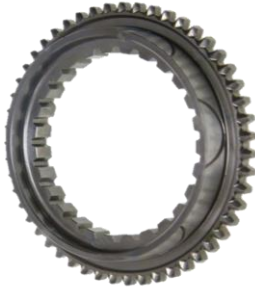
SYNCHRONIZER CONE 27T/51T PART NO: 1310 302 045