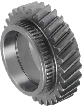
GEAR 4TH SPEED 30T PART NO: 1297 304 127