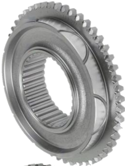
SYNCHRONIZER CONE 34T/51T PART NO: 1285 333 021